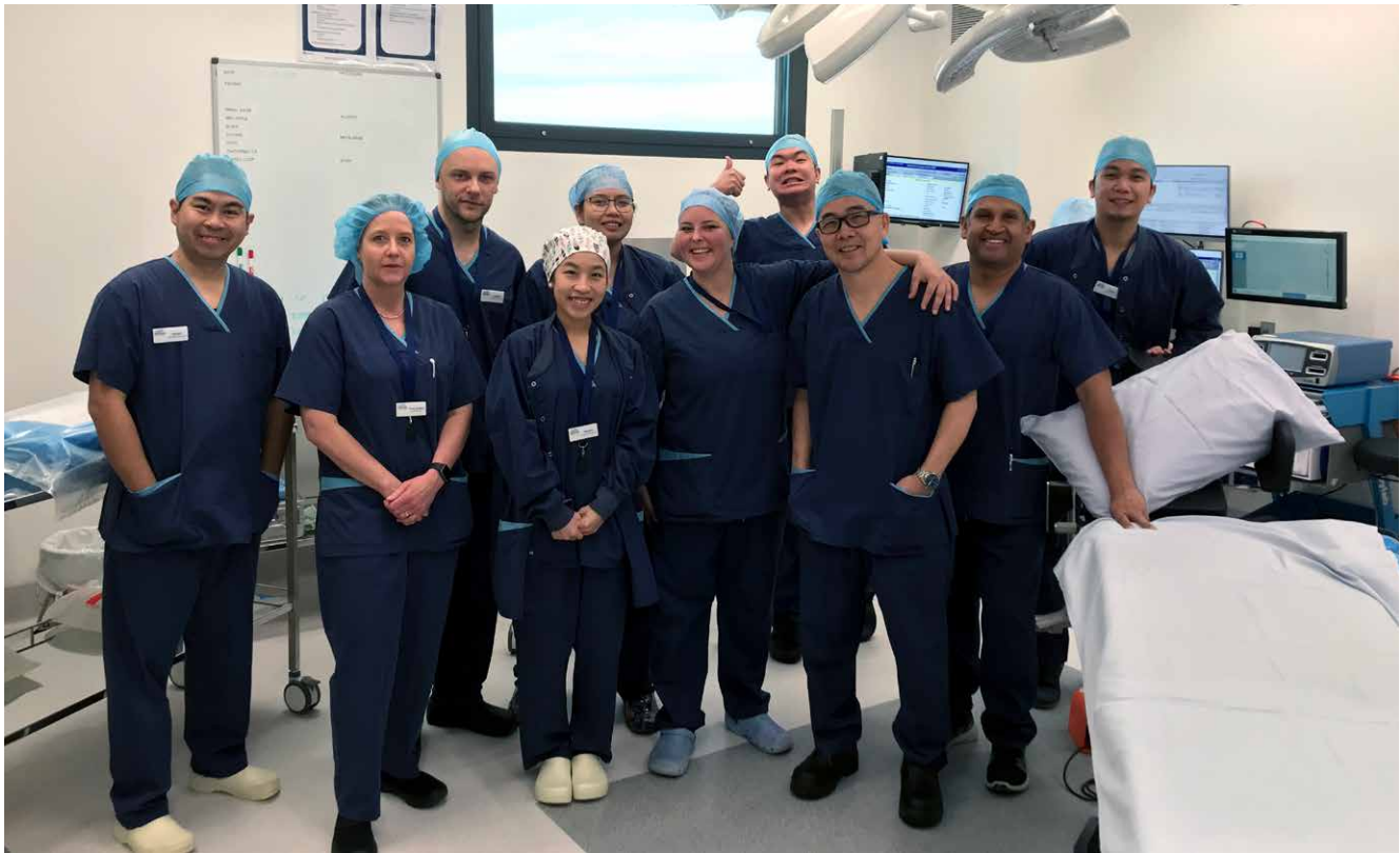
The team at the recently opened North Shore Surgical Centre.

MedPro Healthcare then followed early in the 2019 financial year as well as investments in Active Limited and Active Physio Limited which provide physiotherapy and rehabilitation services.