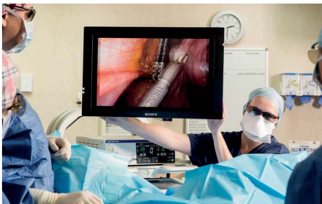
Investing in facilities: Southern Cross Hospital Brightside purchased a 3D high-definition surgical video system – a New Zealand first.

For many years the Trust has provided facilities, medical supplies and medical staff for elective surgeries performed free of charge for those in need. Two years ago this arrangement with surgeons was formalised and funding criteria established. Surgeons are able to apply via Hospitals to provide free surgery for patients who cannot access publicly-funded elective surgery in a reasonable timeframe, and who do not have means to fund it otherwise. Against a background of growing need, we are pleased to be meeting our targets and are working closely with specialists who wish to do more in this area.