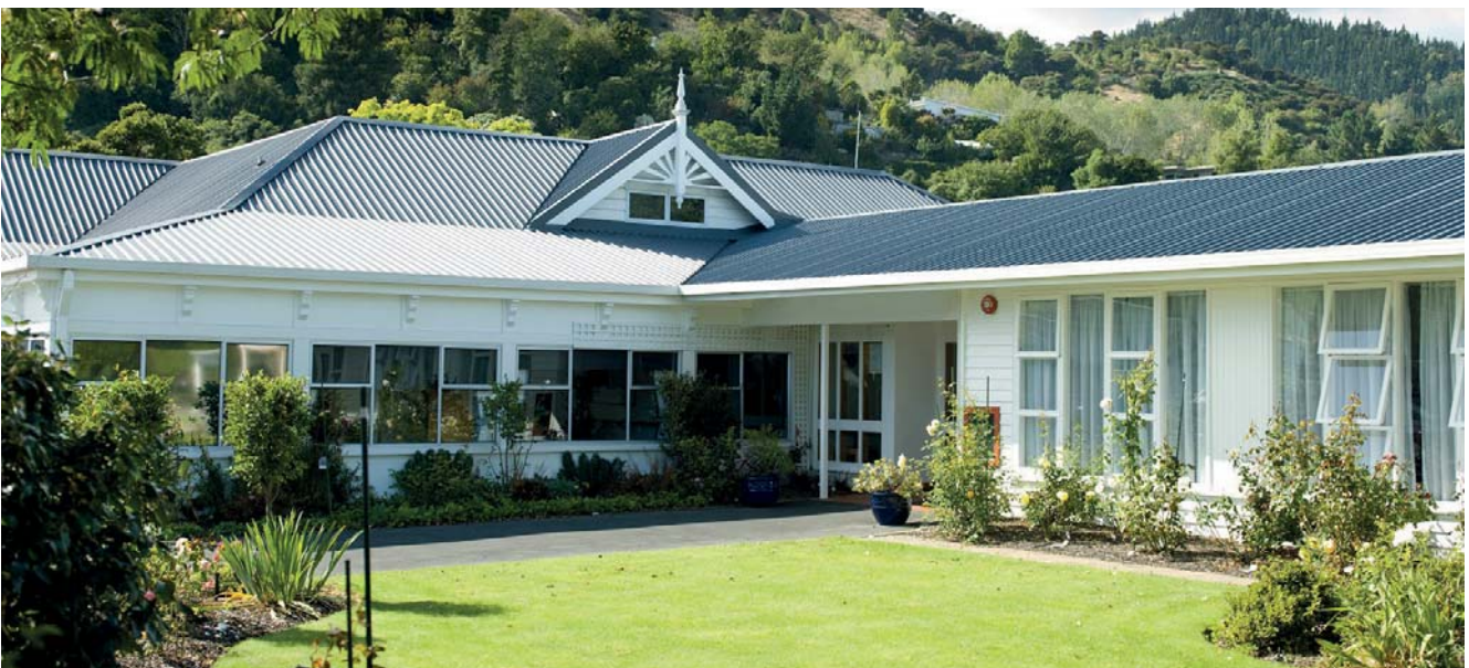
Nelson's Manuka Street Hospital.